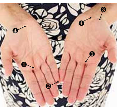
1 The rare guru loop on both hands signifies charisma 2 The print on the little finger shows a talent for communication 3 A rounded area at the base of the palm signifies an affinity with nature 4 This sweeping branch represents travel

purpose is to learn through her relationships with friends and partners. She's here to share her emotions and learn about love.