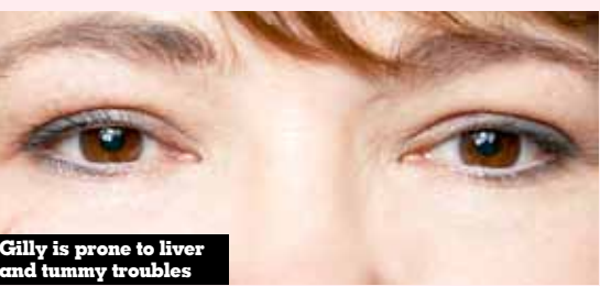
Gilly is prone to liver and tummy troubles

working and aid the digestion process. A good-quality digestive enzyme supplement would also help her body break down food more efficiently.